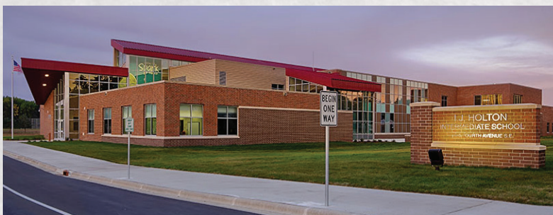
The Hormel Foundation supported IJ Holton school with a land acquisition grant.

program for underrepresented students who are graduates of Austin High School and Pacelli High School to receive financial and academic support to earn a certificate, diploma or degree at Riverland Community College.